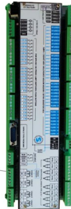
Combi Card IO interface (Single) card